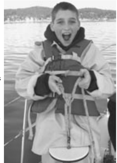
The joys of "science-under-sail" is apparent to all who view the face of this Eastside Prep student